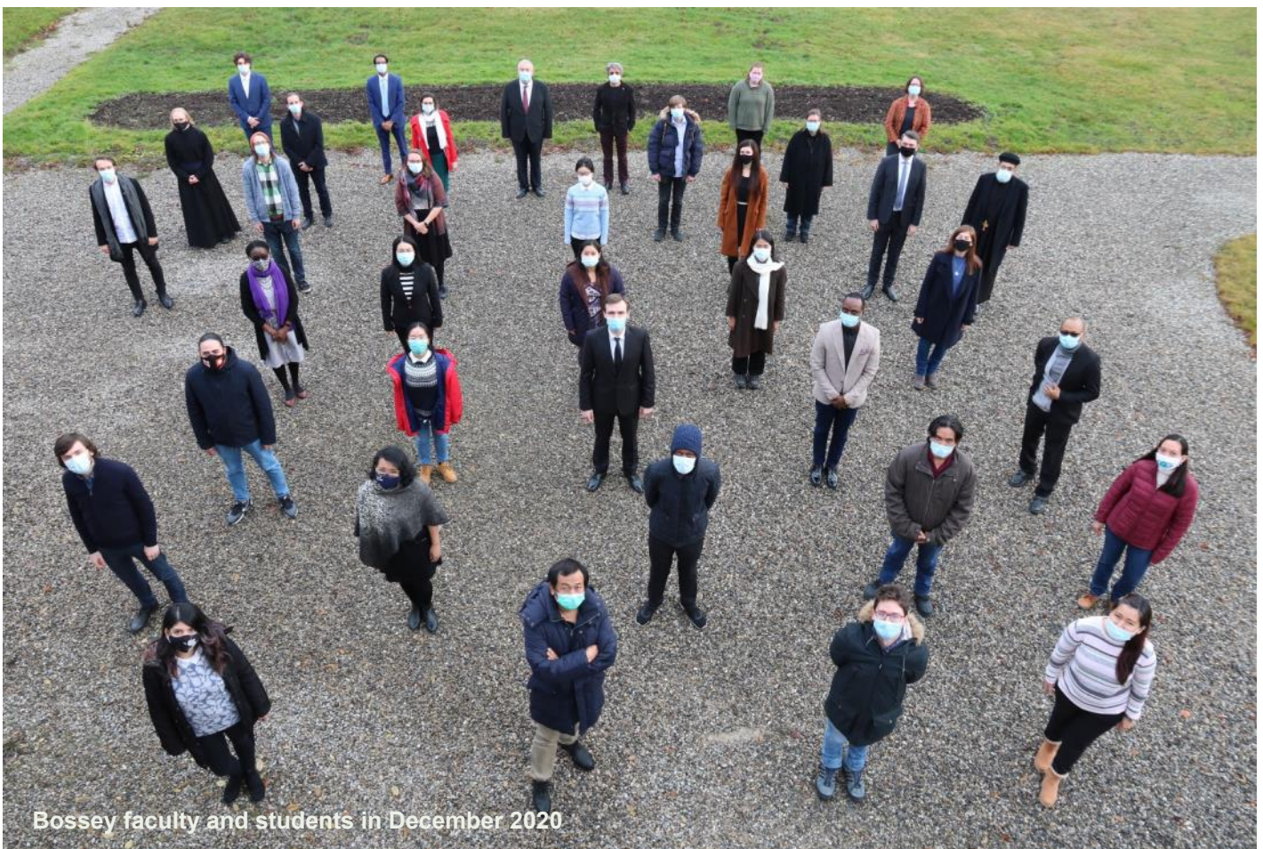
Bossey faculty and students in December 2020

I was grateful that our hosts were so open to conversation and questions.”